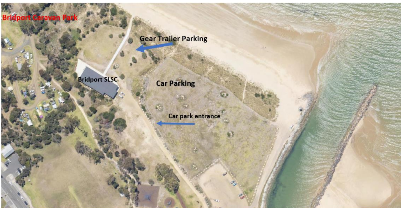
Bridport Statewide Junior and Senior Carnivals – Site Map

Sandshoes will be permitted in the 500m (U8 and U9) and 1km (U10/11/12/13/14) beach runs.