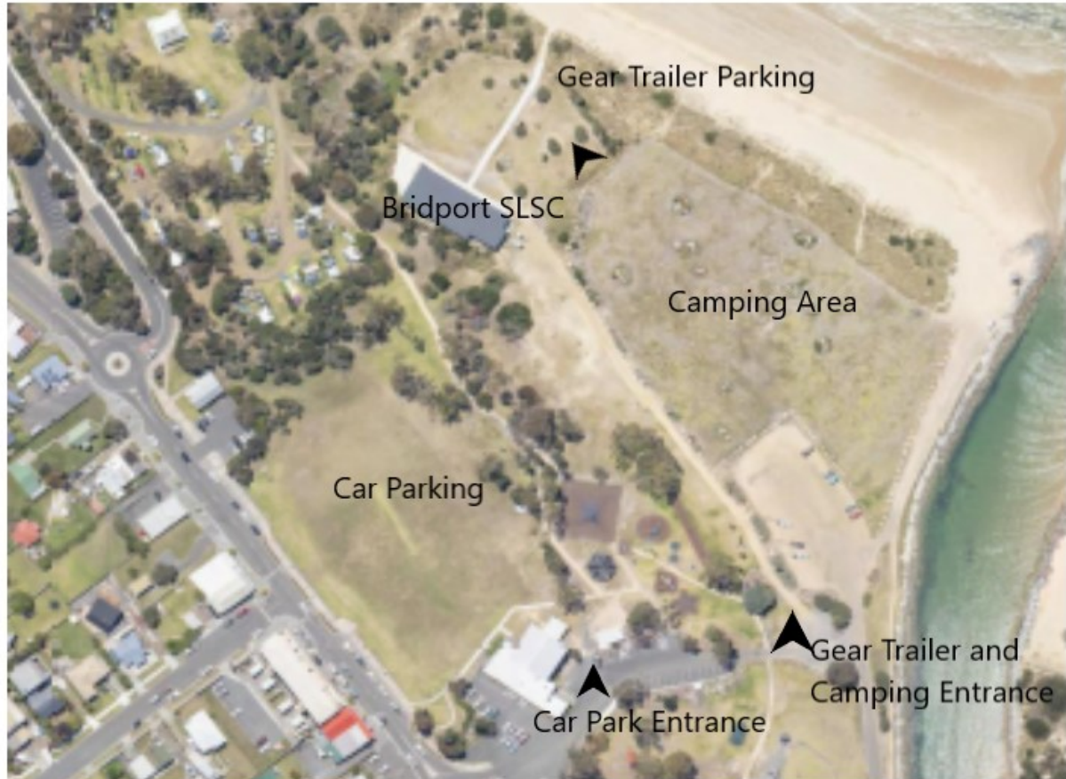
Bridport Statewide Junior and Senior Carnivals – Site Map.